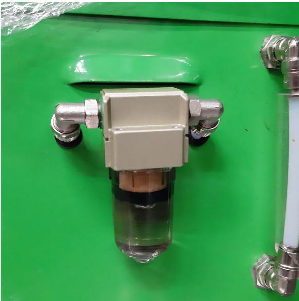
Installation example on reading type 555-8G/N