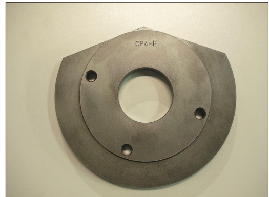
Flangia banco prova Cod.: CP4F