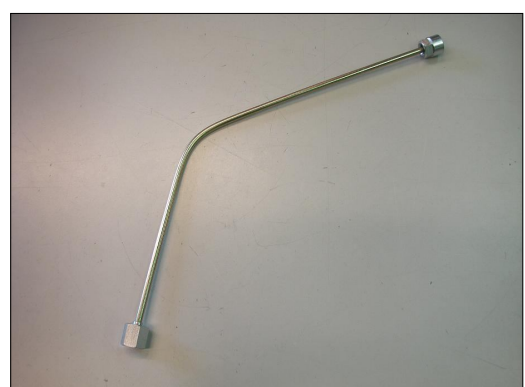
Bench connection tube P.N.: 555-58