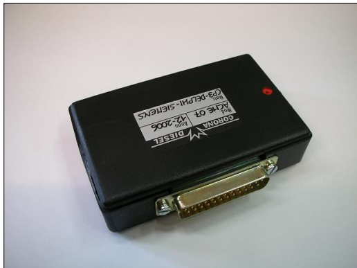
CP3-Delphi-Siemens Software P.N.: ACME07