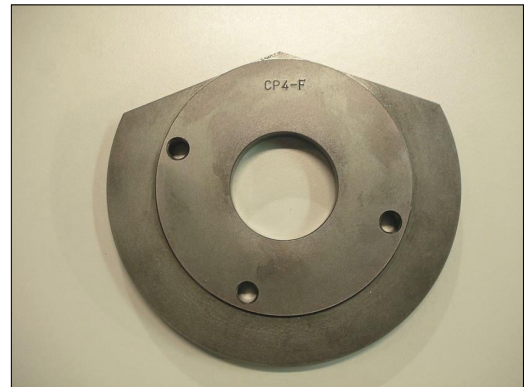
Test bench flange P.N.: CP4F