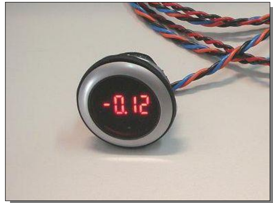
Turbo pressure visual display P.N.: 555-TURB/ DISP