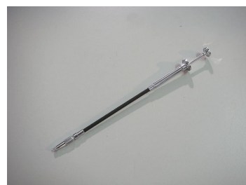
Steel cable to lift comparator