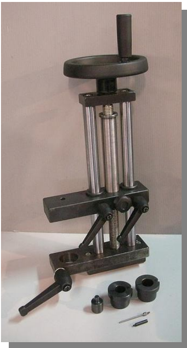
Kit for measuring Bosch electroinjector servo valve height

The support must be supplied with the Q100-N kit.